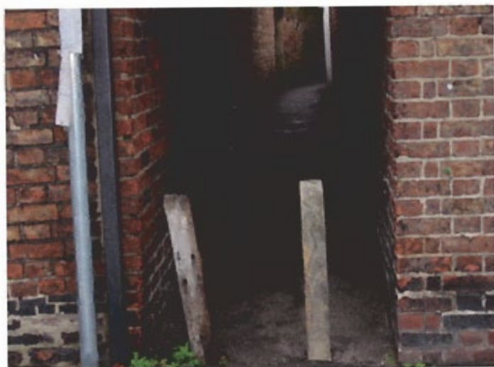
Point A - 'Cycle barriers'